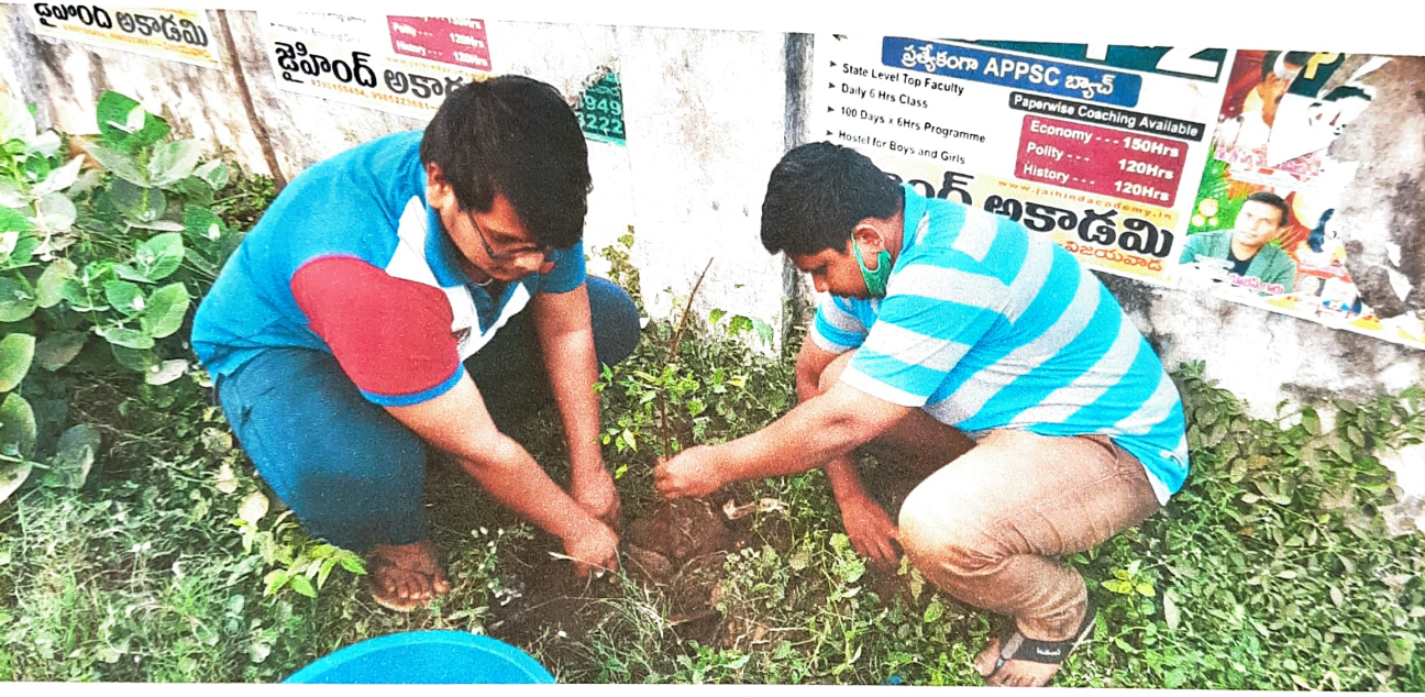
PLANTATION BY B HEMLA NAIK